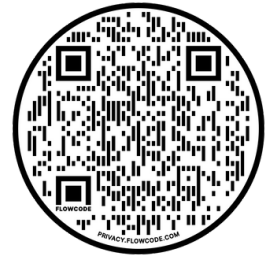
Scan for Studio Policies

Tuition payments: Online through your parent portal (PayPal), ACH, Merchant Services, by check payable to PWDA, or provide us with your debit card and we will process your payments automatically. Place payments in our tuition mailbox located upstairs just outside of Studio B and the bathroom, or downstairs outside of Studio A . Both are marked "Tuition Mailbox"