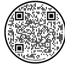
Scan for Parent Portal

Join our PWDA Student & Parent Facebook group & stay connected! https://www.facebook.com/groups/1436211426416508/ IG: @princewilliamdance